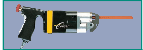
PL Saws - For High-volume Production Environments