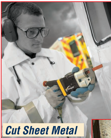
Cut Sheet Metal