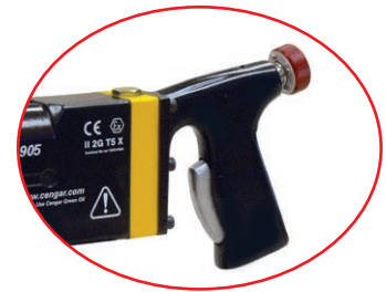
Model PL905FT Inside trigger (optional)*