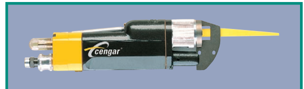
JP Saws - For Fiberglass and Sheet Metal Production