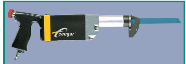
CL Saws - For Demanding Maintenance Applications